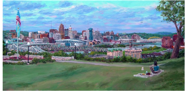
" 'Nati at Sunset'"

Overall, I'm still on a healthy pace, chugging along travel-wise and getting more cityscapes under my belt. With the recent completion of a Cincinnati piece (at right), I have now captured 25 unique cities in oil (all still personally visited) and 41 paintings in all. That tally puts me about ¼ towards my lifetime goal of 100 or so cities to visit and paint ...perhaps a good reason for a glass of fine champagne-ya!?